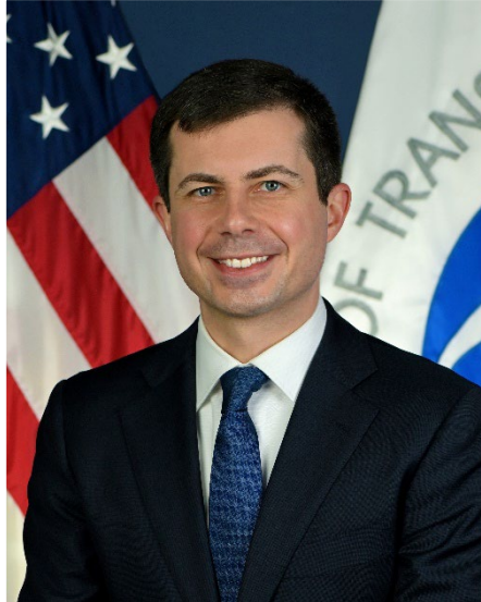
Secretary of Transportation Pete Buttigieg

To foster and promote the U.S. Merchant Marine and the American maritime industry to strengthen the maritime transportation system — including landside infrastructure, the shipbuilding and repair industry, and labor — to meet the economic and national security needs of our Nation.